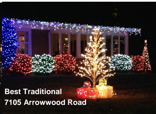
Best Traditional 7105 Arrowwood Road