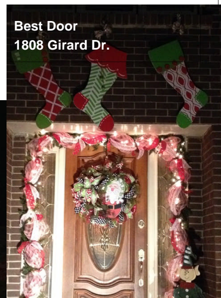
Best Door 1808 Girard Dr.