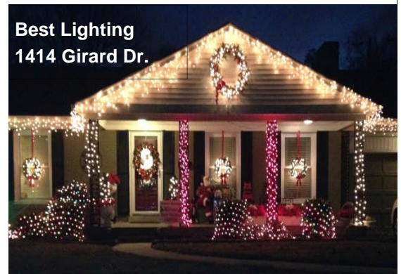
Best Lighting 1414 Girard Dr.